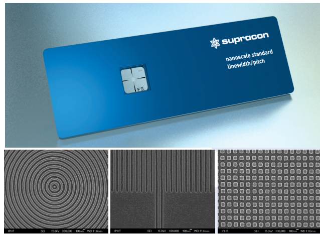
SEM-micrographs of the calibration pattern

The Nanoscale Linewidth/Pitch Standard consists of different grating structures etched in nanocrystalline silicon on a quartz substrate. The optical contrast of the pattern in the UV wavelength makes it suitable for transmission and reflection UV and laser scanning microscopy. The types of grating are 1-dim (for both x and y), 2-dim (cross grating) and circular. An isolated single structure for CD determination is added on one side of the 1-dim grating. The pitch values are 160, 200, 230, 260, 300, 400, 500, 700 nm, 1 \mu\text{m} and 4 \mu\text{m} , i.e. the structure widths are between 80 nm and 2 \mu\text{m} . With the exception of the larger 4 \mu\text{m} -structures each grating has an area of around 10 x 10 \mu\text{m}^2 .